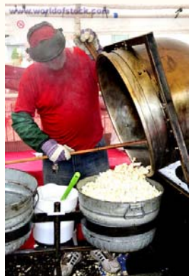
Old Fashioned Kettle Corn