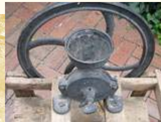
Old Fashioned Corn Grinding