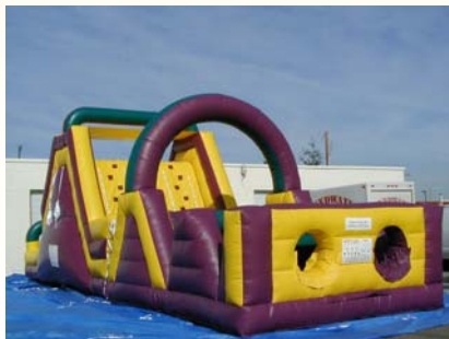
Bouncy Obstacle Course