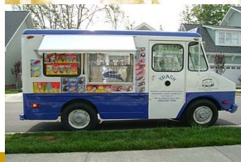
Ice Cream Truck arrives 8:45 PM!!